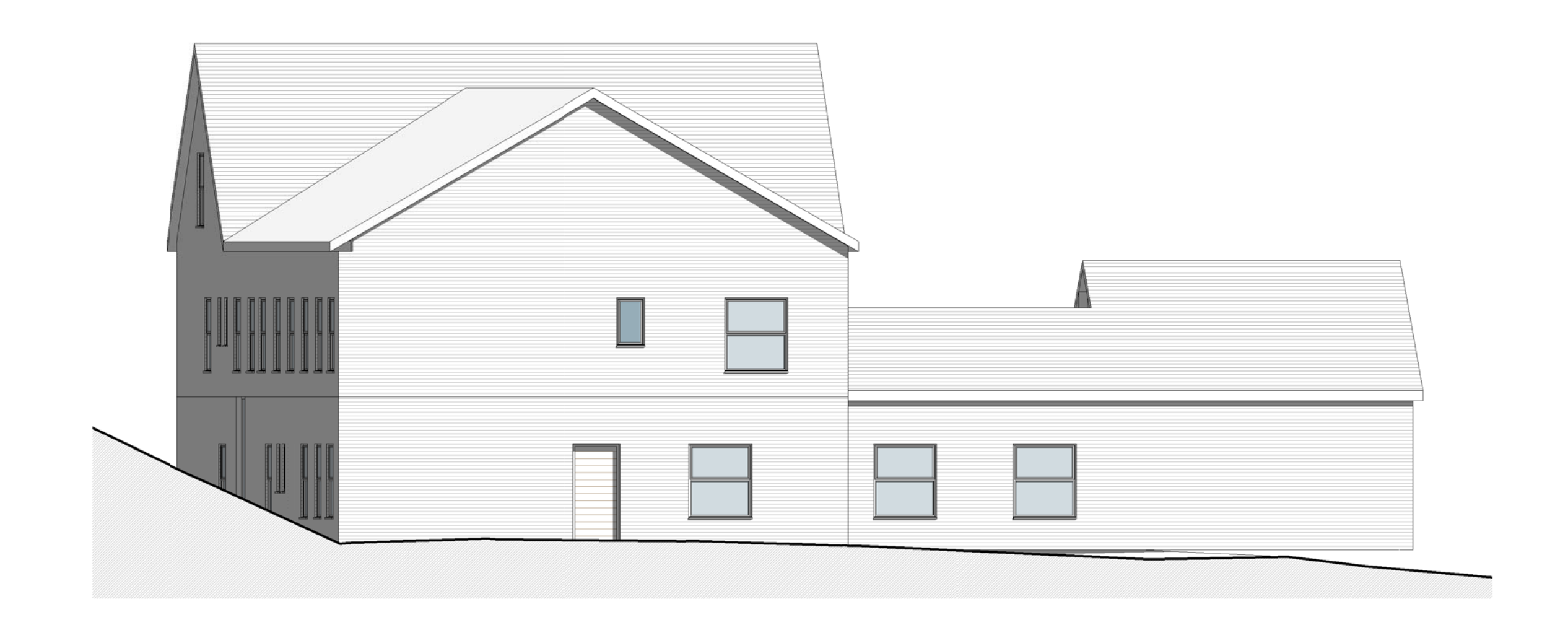
3. Rear - Existing