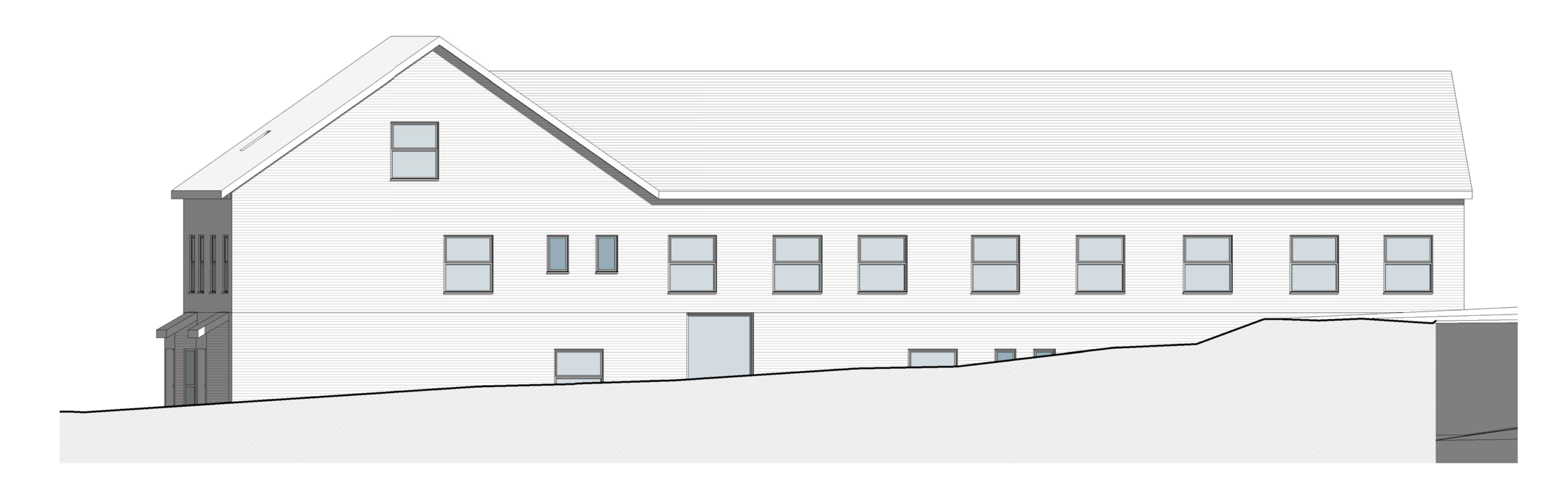
4. Right Side - Existing