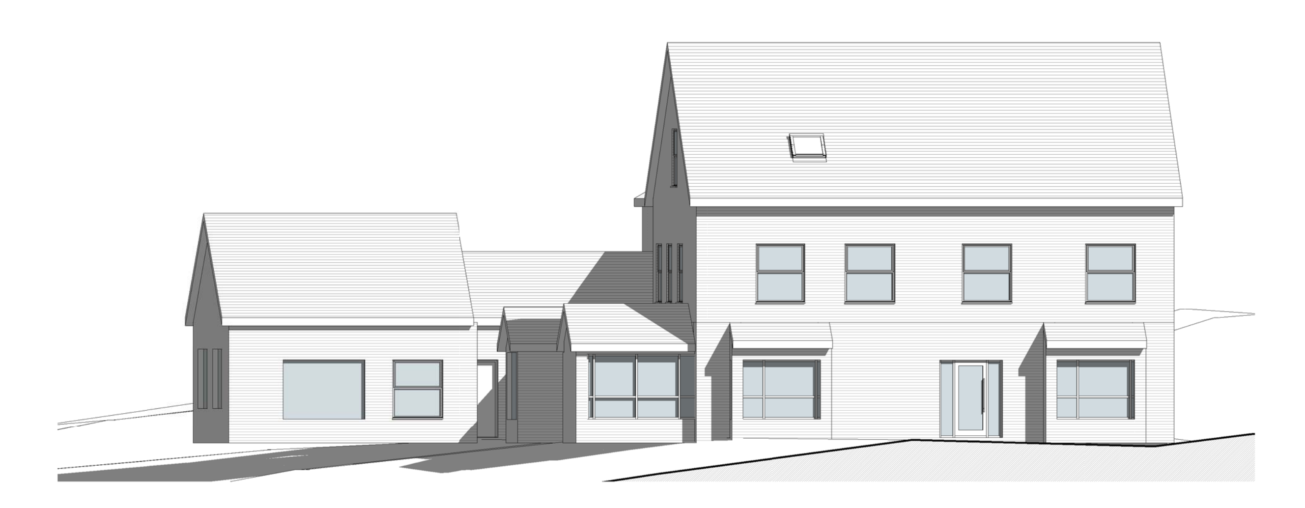
1. Front - Existing